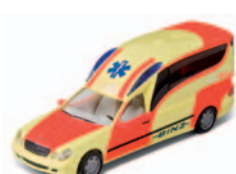
Power for emergency help