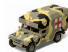
Power for field hospitals