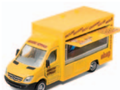
Power for warm snacks