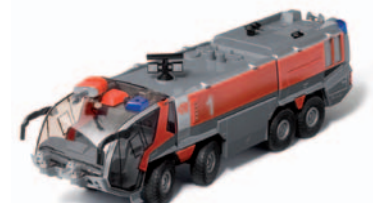
Power for disaster control