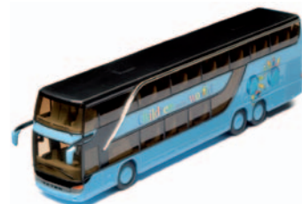
Power for catering