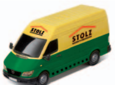
Power for DIY and hobby