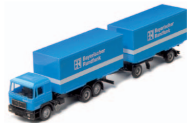
Power for complete reports