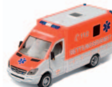
Power for intensive care