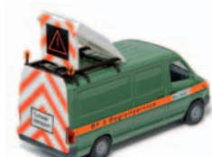
Power for on the road