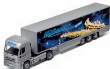
Power for shows and demos