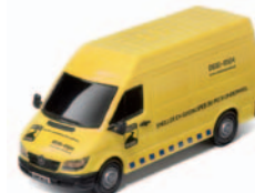
Power for breakdowns