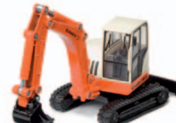
Power for construction