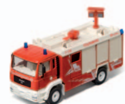
Power for mobile incident control