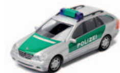
Power for communication