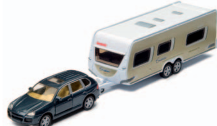
Power for recreation